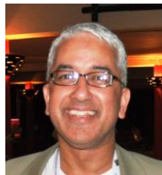
District Judge Shamim Qureshi ENGLAND AND WALES