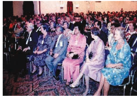
Delegates at the Opening of the Seventh CMA Conference, Cyprus 1985