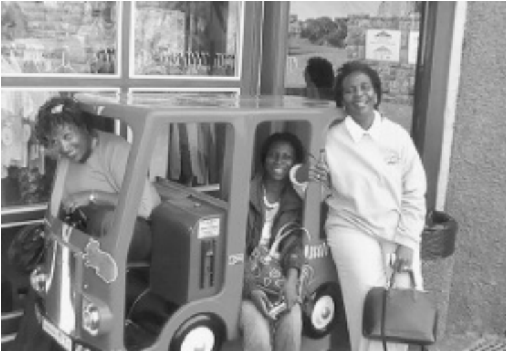
New govt car for High Court Judges Theron, Owusu and Wade-Miller.